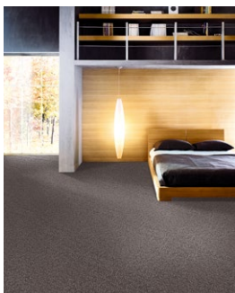
Urban Wool / Access Carpet / Twist Pile