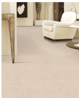
City Freedom / Access Carpet / Twist Pile