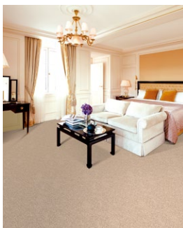
Watermans Bay / Access Carpet / Twist Pile